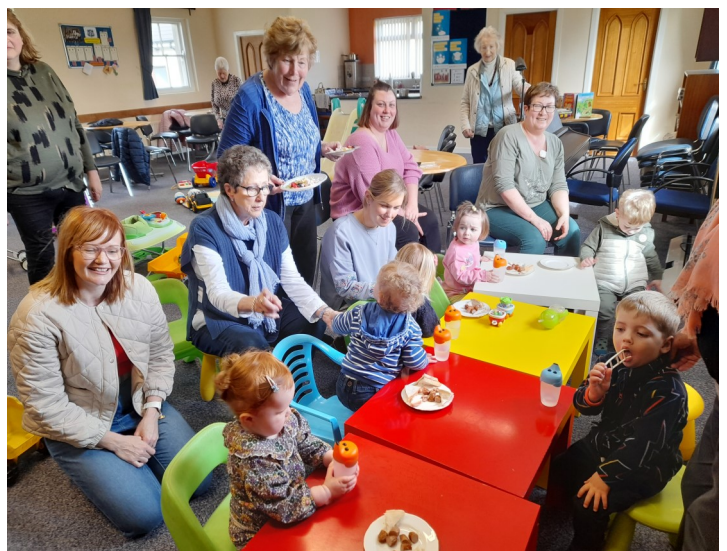
Fun, food & new friends at Soldierstown Tots

Existing members will be welcome back - and new children are always welcome. Mums, dads, grand-parents, carers etc all welcome too!