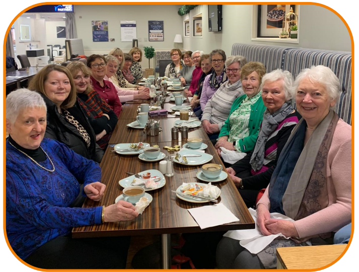
Enjoying coffee at Vic-Ryn

January 2024 - ladies met for coffee at Vic Ryn. A lovely morning to catch up with everyone.